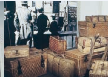
Basket-weavers' museum in Dalhausen

In the St. Mary's pilgrim village Dalhausen , the basket-weaver museum presents skilled craftsmen and -women live at their work. The former shipping village Herstelle - founded in 797 by Charlemagne - has become well known through the Abbey of the Holy Cross, the castle (1832) and the Weser ferry for pedestrians and bike riders.