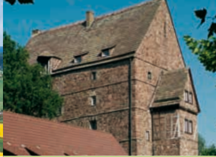
The fort in Beverungen