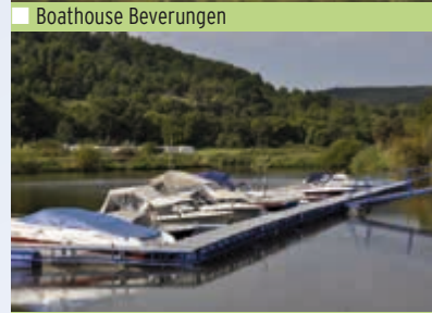
Yacht port in the »Dreiländereck« (Three-state corner)