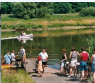
Pedestrian Ferry in Wehrden