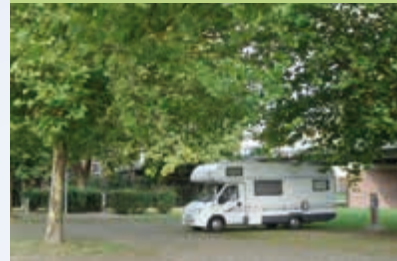
Camper parking space at the river Weser in Beverungen