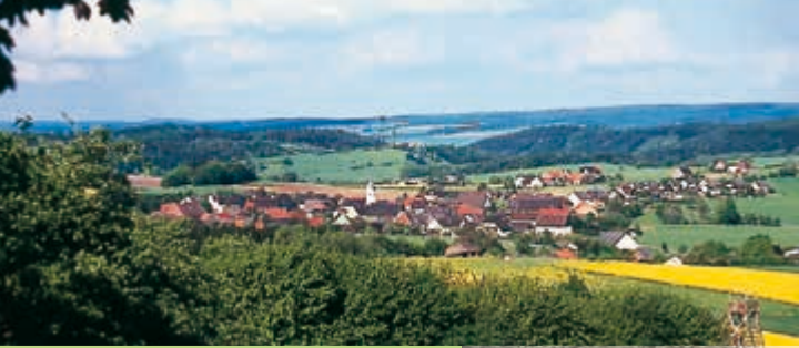
View of Drenke and the Weser valley