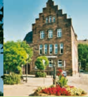
Former district court in Beverungen

The two hill villages Jakobsberg and Haarbrück offer a spectacular view far into the country. Typical farming characteristics are found in the high-altitude villages Tietelsen , Rothe and Drenke .