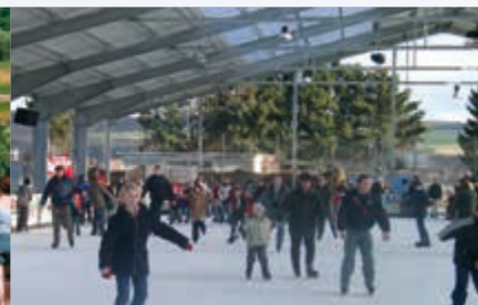
Fun on ice at the skating rink Beverungen