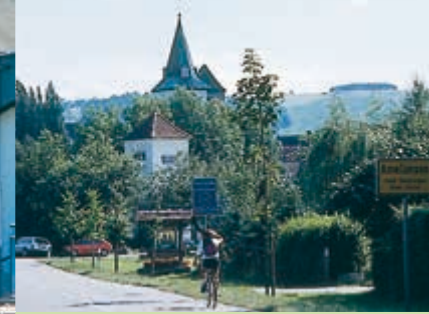
Historically significant Amelunxen on the river Nethe