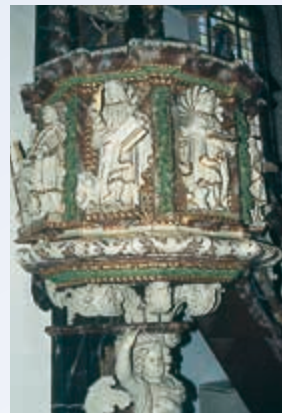
Baroque pulpit in the church at Tietelsen

Drenke and Tietelsen are worth a visit in their churches, which house precious treasures, while Rothe, as a settlement, is regarded to be a hamlet, known for its guard-tower of 1429.