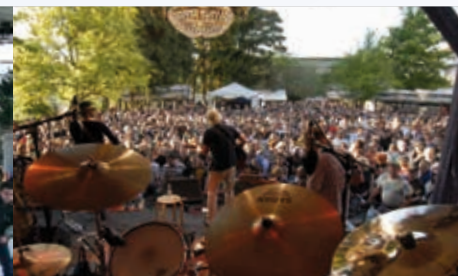
Open-air event in Beverungen: The Orange Blossom Special