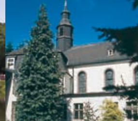
Monastery church in Herstelle