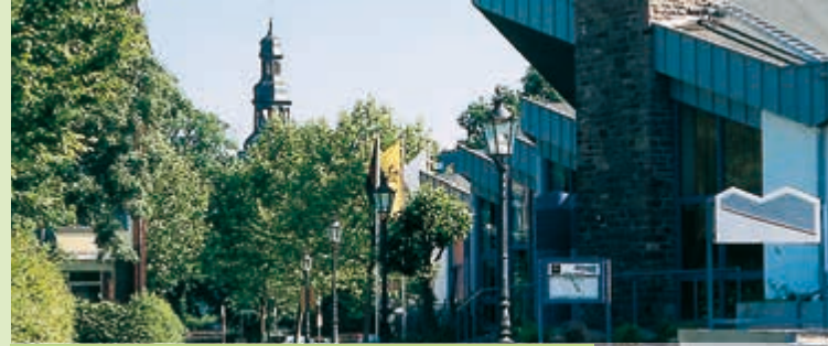
The theatre hall in Beverungen offers a variety of cultural events

»Yesterday we travelled down the river Weser and I can say that seldom in my life I have been so touched and excited as during this gradual appearance of the old hills and villages along the way.«