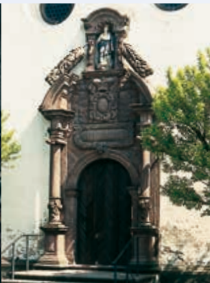
Weser-sandstone portal of the church in Blankenau