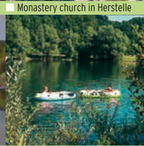
Lake »Axel« near Würgassen

Drenke and Tietelsen are worth a visit in their churches, which house precious treasures, while Rothe, as a settlement, is regarded to be a hamlet, known for its guard-tower of 1429.