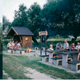
Resting place in Wehrden