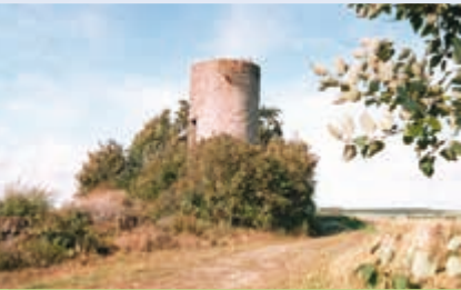
Middle-age guard tower near Rothe

The two hill villages Jakobsberg and Haarbrück offer a spectacular view far into the country. Typical farming characteristics are found in the high-altitude villages Tietelsen , Rothe and Drenke .