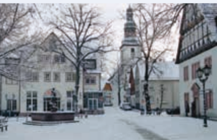
Beverungen's Kellerplatz in winter

A farmers' museum is not just fun for children. And near Würgassen , the bizarre rock formations of the Hanover Cliffs attract attention. The village Wehrden is well known as a favourite resting station for bikers, who can cross the river Weser on the ferry in the midst of nature.