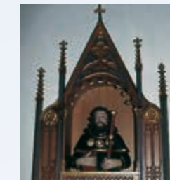
St. Jacob's sculpture in the church of Jakobsberg

The visitors will be guaranteed a variety of rural charm. In Amelunxen families with children will enjoy »holidays on a farm«. In Blankenau , the farm houses and the catholic church (1714) still remind of the »good old times«.