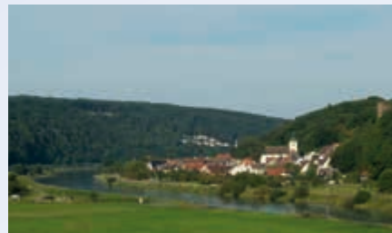
View of Herstelle and the Hanover Cliffs

The precious altar picture by Johann Georg Rudolphi in the catholic baroque church of St. John the Baptist is regarded as a special treasure. Friendly Weserland gastronomy as well as a colourful palette of various leisure activities are offered for young and old. Water sport is especially popular.