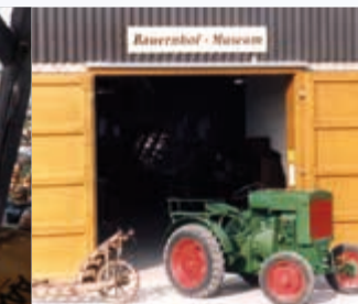
... on the Erlenhof near Herstelle