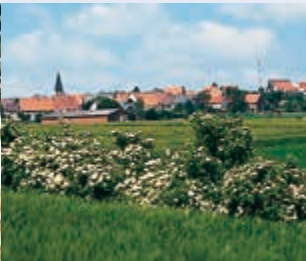
Rural tranquillity in Haarbrück