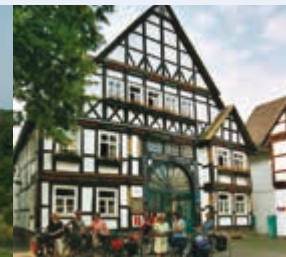
The colourful timber-framed Cordt-Holstein-House in Beverungen

The region around the cultural area of Höxter with its old monasteries and beauty of nature offers recreation in a historical countryside either on foot or by bicycle. With the 450-km long Weser-bicycle path R99 and the well-built bicycle-path system Beverungen has become a bike-friendly holiday area par excellence. Pure culture is presented with opera and plays, cabaret and (rock) concerts in the town theatre as well as at the favourite blossom- and the rifle-shooting festival. Not to forget the Carnival, which shows that the people of Weserland know how to celebrate. And from November to March, the Beverungen skating rink offers lively fun on ice.